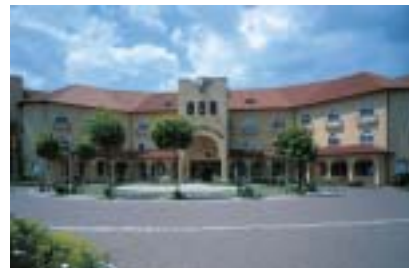
Hotel Mercure Riesa