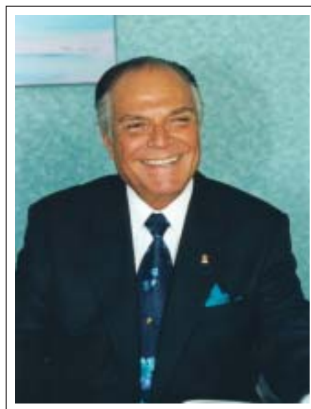
Dr. Rubén Acosta FIVB President

It is our wish at FIVB that the 2002 Women's World Championship succeeds in presenting the European and German public with a memorable, first-hand volleyball experience. If we manage to do this, we can bring Europe and Germany into the worldwide stream of Volleyball with more players, supporters and media attention - all very important elements in satisfying our mission to promote Volleyball on a global scale.