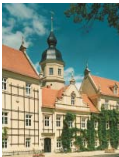
Riesa's Townhall is an attraction for tourists