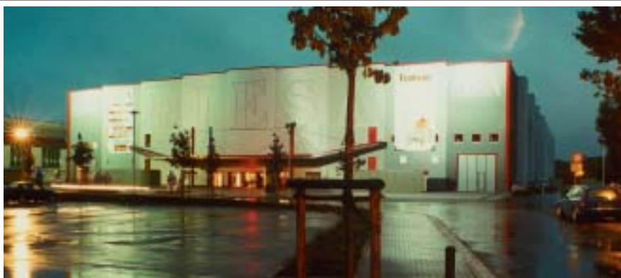
The "erdgas-arena" will host matches of the first and second round

The atmosphere at "erdgas arena" has become almost legendary. Be it indoor soccer, boxing, handball, ice skating shows or dancing - the crowds regularly make the floors vibrate. The enthusiasm and expertise of Saxony's sports fans have been praised by all competitors. This also applied to the volleyball World League and the DVV Cup finals, and will be no different at the World Championship.