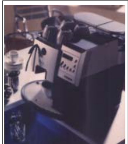
"Royal Cappuccino" is a classic from Saeco

A well-structured and smooth distribution of the products is the heart of the company. Consequently, the organisation of the company has been adjusted to the most important groups of customers and respectively structured. Saeco Germany considers itself as a service company for sales agents, wholesalers and retailers of the various