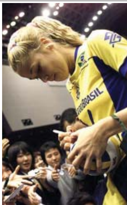
Highly sought after by the fans: Erika's autograph