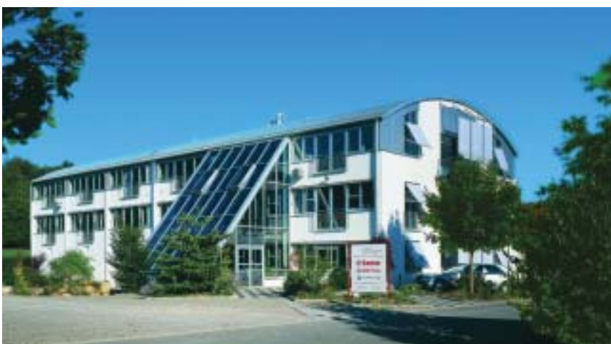
Saeco Germany's headquarters at Eigeltingen