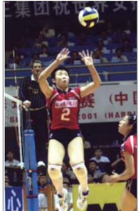
Their fast game is one of the strong points of the Chinese

The national team also have their sights set on the gold medal at the Asian Games Volleyball Tournament in Pusan, Korea in September, where their toughest rivals will be Japan and Korea. China is considered a favorite for the gold medal.