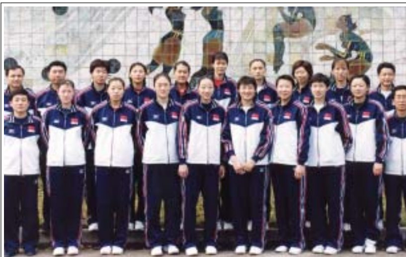
China's young team is considered one of the top favourites at the World Championship in Germany