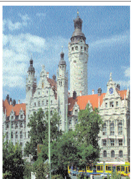
Leipzig's Townhall is an attraction for tourists