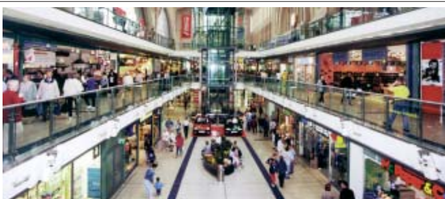
The Railway Promenade in Leipzig well-known in Germany.

Visitors can choose among more than 100 hotels and guesthouses in various categories with altogether more than 15,000 beds in Leipzig. The traditionally large number of restaurants, bars and cafés is still increasing. Night owls are spoiled for choice - there is no closing time! Leipzig also has a Welcome Card, a must for everybody who wants to discover the city. LEIPZIG CARD is valid for public transport on trams and buses but also offers special reductions for concerts and theatres, museums and the zoo. Leipzig's countryside is marked by an harmonious relationship of nature, historical and cultural sites.