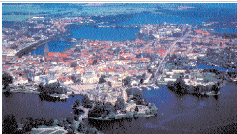
The capital of Mecklenburg-Vorpommern, Schwerin is famous for its wealth of water and forests.