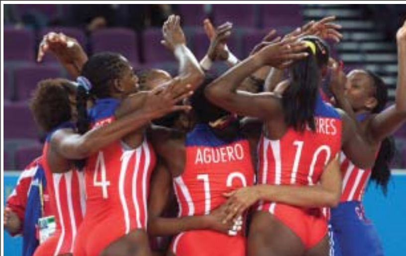
A usual picture: celebrating Cubans – at the 2002 Worlds in Germany again?

Win or lose, the sheer emotion, excitement and dynamism of this outfit of Caribbean superstars makes the team one of the great attractions of Germany 2002. Watch them play and you can truly say you have seen the best the sport has to offer.