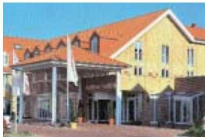
Crowne Plaza Hotel Schwerin